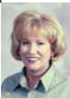
Ann G. Phillips Cosmetology